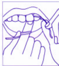
Using floss between upper teeth.